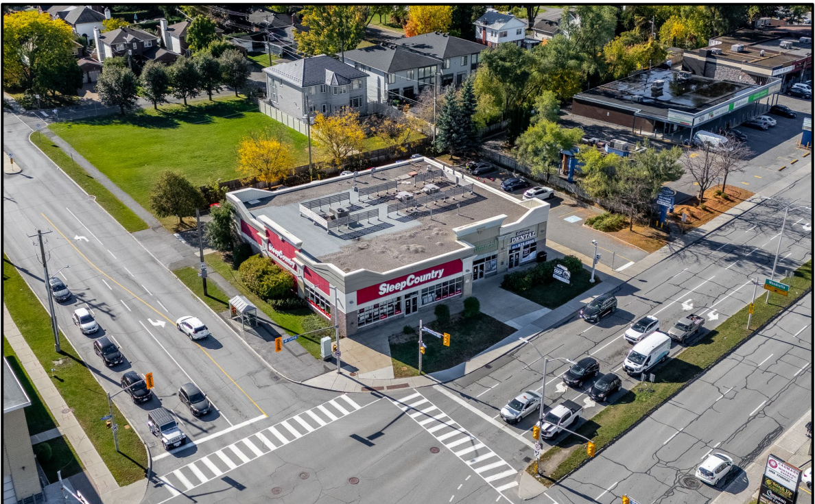
2194 Carling Avenue

The Property is situated on approximately 0.55 acres, with a weighted average base rent of $35.92 per square foot and a weighted average lease term (“WALT”) of 4.5 years.