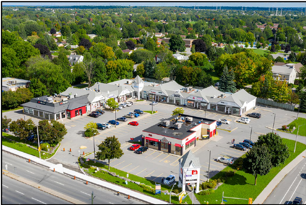
474 Hazeldean Road

The Property consists of a multi-tenant retail plaza with 15 tenants, including a mix of national, regional, and local retailers, as well as a free-standing drive-thru pad building.