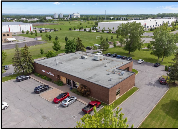
849 Shefford Road

The Property is leased on a long-term basis to VCA Canada, which operates more than 1,000 animal hospitals across the United States and Canada.