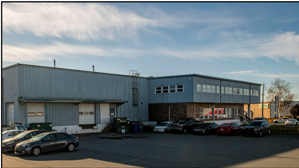
10 Mosher Drive