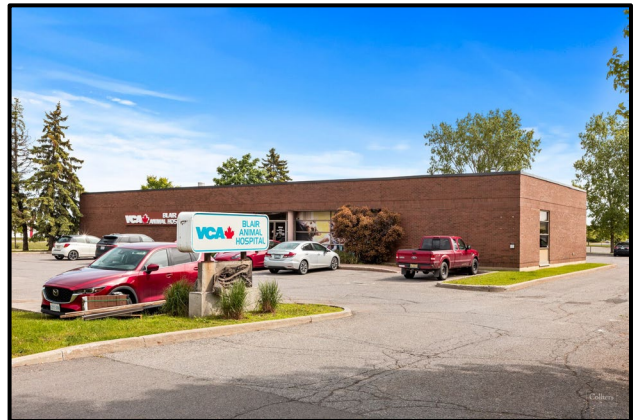
849 Shefford Road