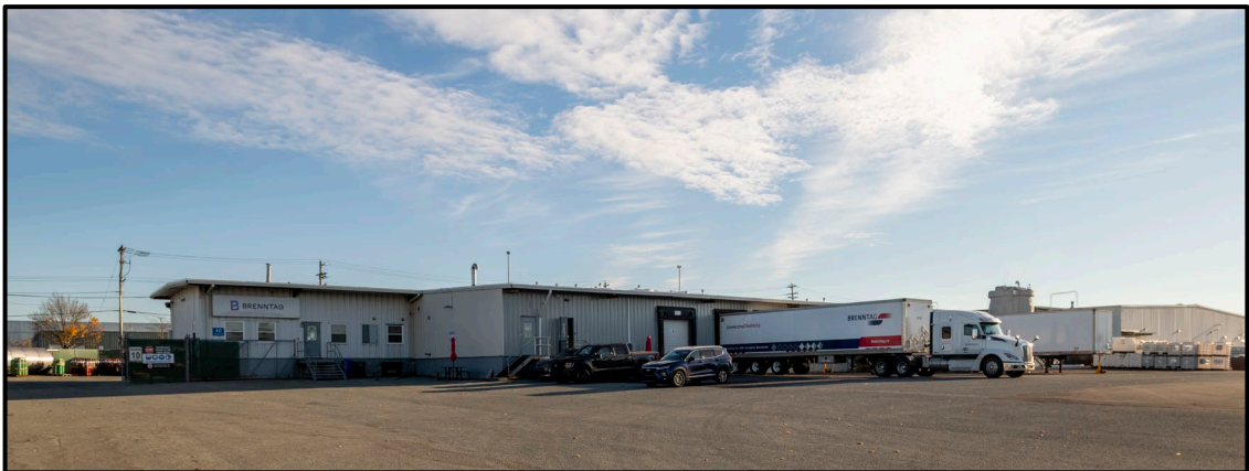
40 Pettipas Drive